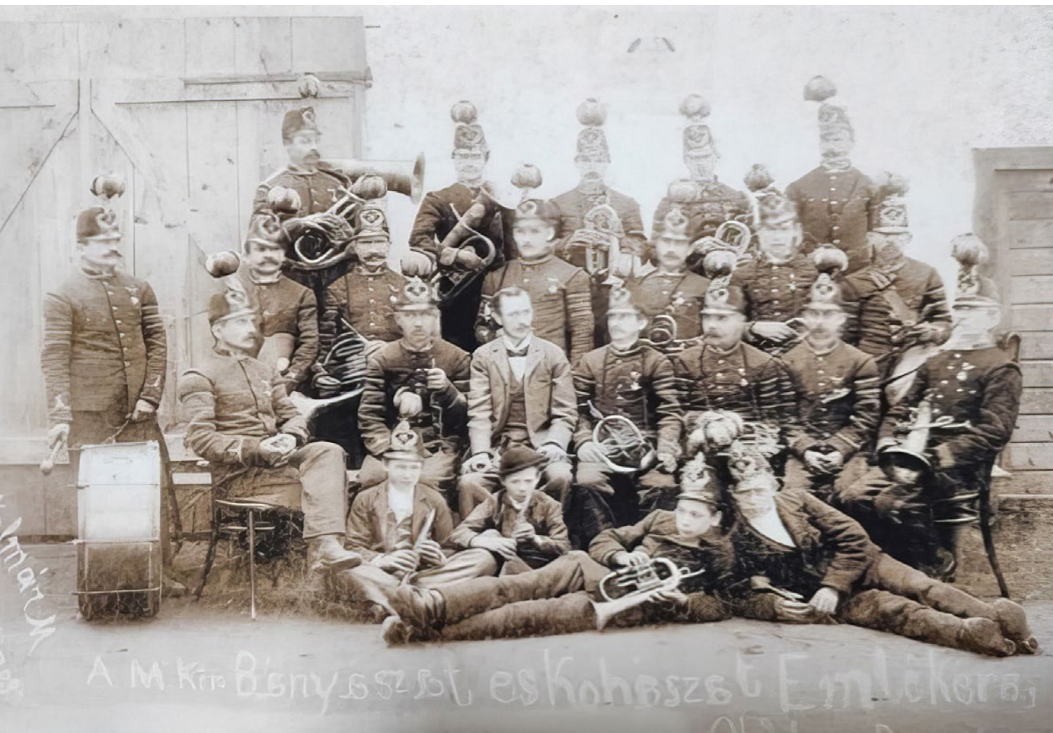
photo: The Băiuț Brass Band, 1886