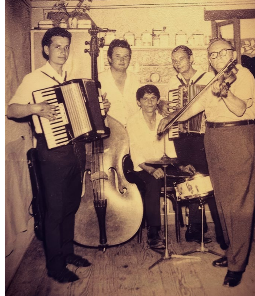
photo: Music Ensemble Within the School, Băiuț