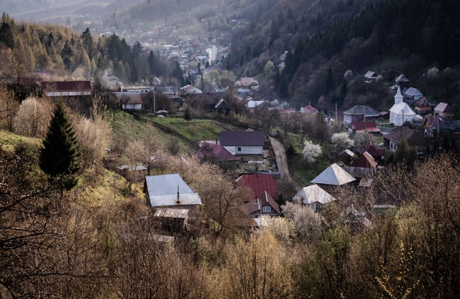
photo: The village of Băiuț, spring 2026